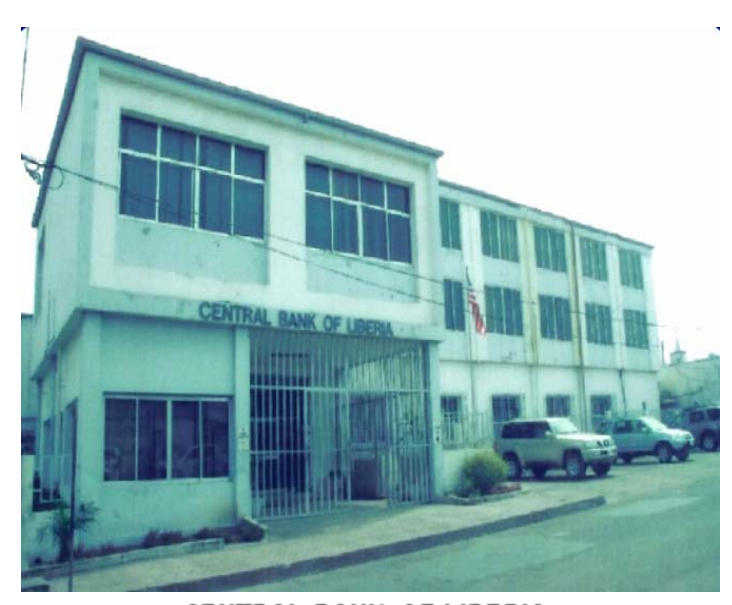
CENTRAL BANK OF LIBERIA