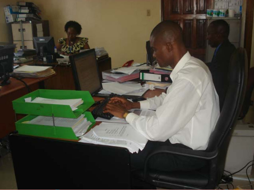
CBL Internal Auditors at work

The Internal Audit Charter of the CBL was developed by the current administration to clearly define the mission, scope, accountability, responsibility, authorization, independence and standards of the Internal Audit function. The Charter, in effect, is In-