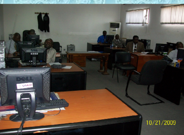
Banking Supervision Staff at Work regular and timely basis.

tions, directives and guidelines for the effective regulation and supervision of financial institutions, and ensure compliance by licensed financial institutions with, and enforcement of, all CBL's regulations, directives and guidelines. The primary responsibility of the Supervision & Surveillance Section is to ensure the effective and adequate supervision and monitoring of the performance and developments in the financial system on a