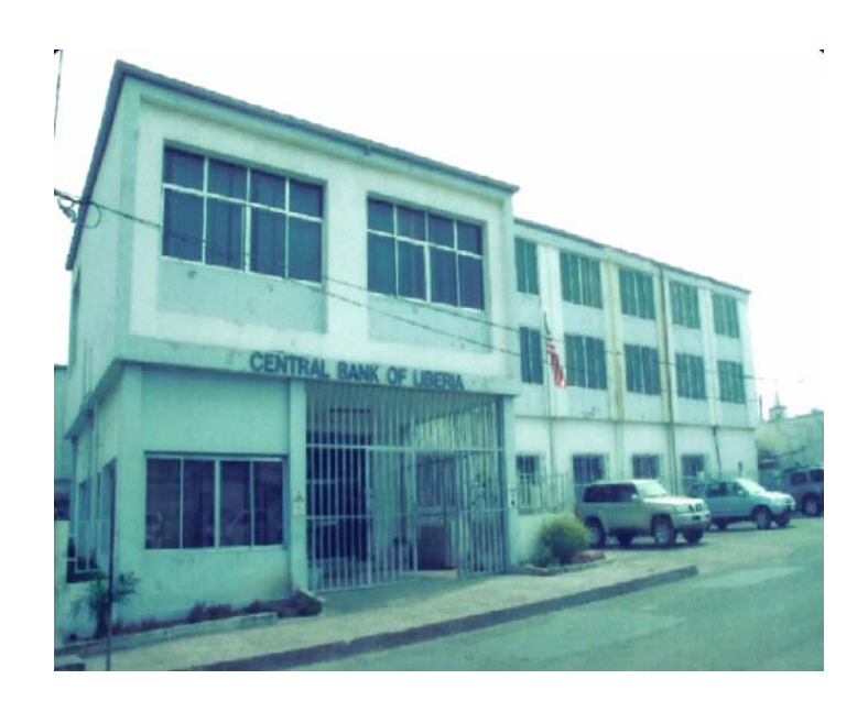
CENTRAL BANK OF LIBERIA