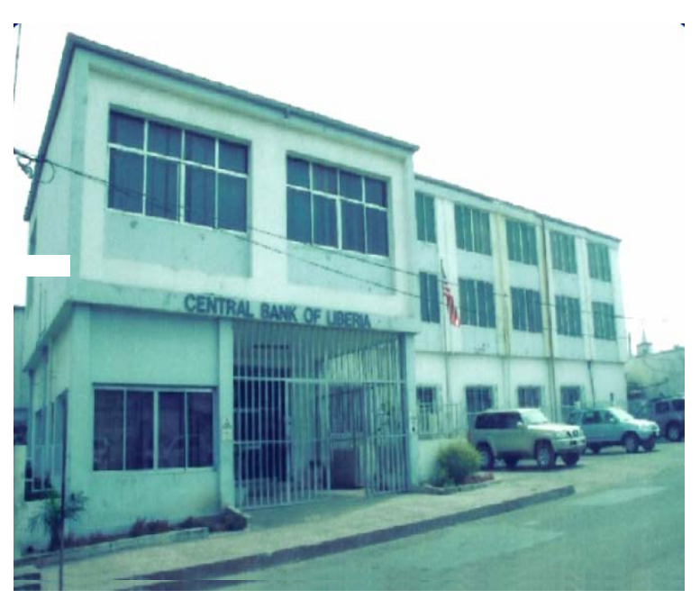
CENTRAL BANK OF LIBERIA