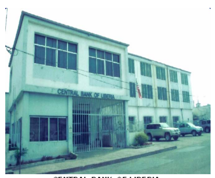
CENTRAL BANK OF LIBERIA