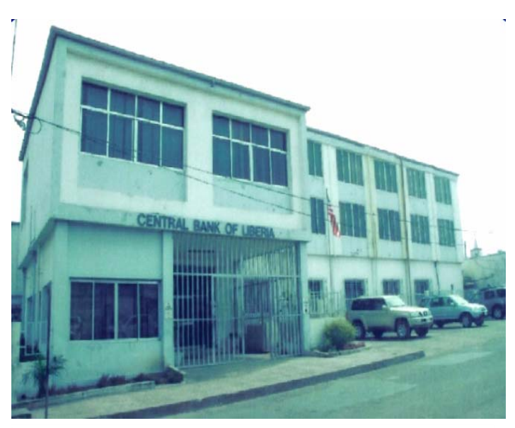
CENTRAL BANK OF LIBERIA