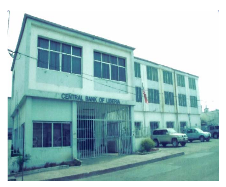
CENTRAL BANK OF LIBERIA