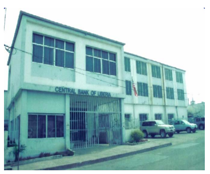
CENTRAL BANK OF LIBERIA